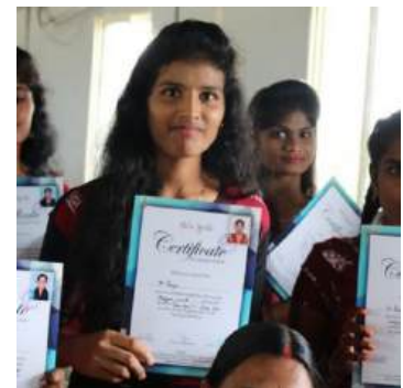
Sudara provides wellness services, and choice of training programs and/or job opportunities for women in India who are vulnerable to sex trafficking