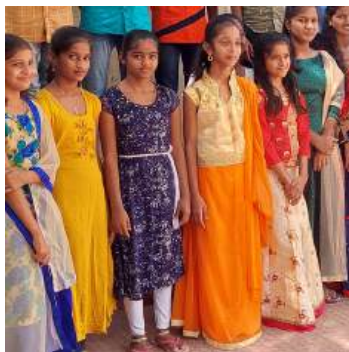
Profits from the sales of Sudara goods provide skills training for more women