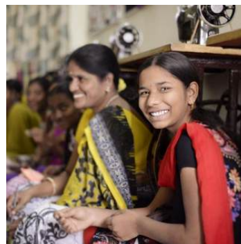
Women who choose tailoring have the option for employment in our partner sewing centers in India