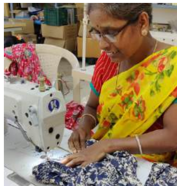
Partnerships with wholesalers, distributors and corporations support Sudara and the women we serve